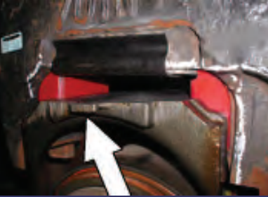
Rail Bumper Guard