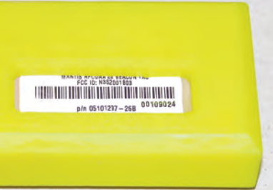
Incapsulated RFID Tag